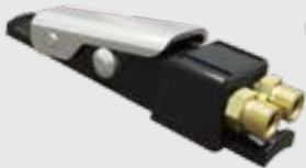
AirStop Pneumatic Control Handle CAT-0302-01-00 Page 222 to 225