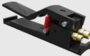
AirStop II NPT Pneumatic Control Handle CAT-0302-03-00 Page 230 to 233