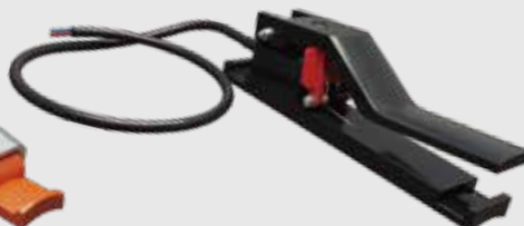
AirStop II Electric Control Handle CAT-0303-03-00 Page 254 to 257