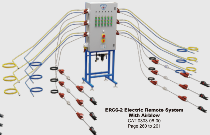
ERC6-2 Electric Remote System With Airblow CAT-0303-06-00 Page 260 to 261