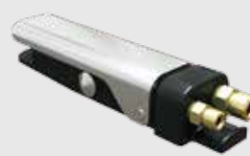
AirStop IV NPT Pneumatic Control Handle CAT-0302-05-00 Page 238 to 241