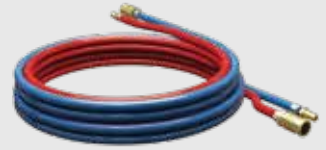
20M (66') Twinline EXT/ Hose Assembly CAT-0304-01-00 Page 266 to 267