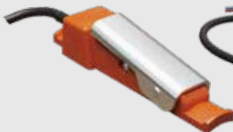
AirStop Electric Control Handle CAT-0303-02-00 Page 250 to 253