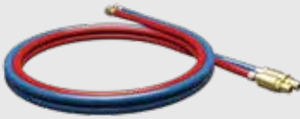
10M (33') Twinline Hose Assembly CAT-0304-01-00 Page 266 to 267