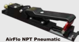
AirFlo NPT Pneumatic Control Handle CAT-0301-03-00 Page 218 to 221