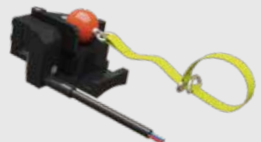
QuikStop IIS Electric Control Handle CAT-0303-05-00 Page 242 to 245