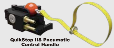
QuikStop IIS Pneumatic Control Handle CAT-0301-01-01 Page 210 to 213