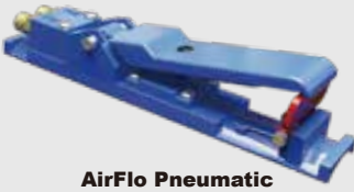
AirFlo Pneumatic Control Handle CAT-0301-02-00 Page 214 to 217