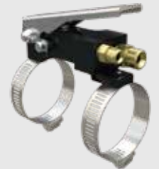
AutoLok Control Handle Assembly CAT-0302-04-00 Page 234 to 237