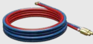
20M (66') Twinline Hose Assembly CAT-0304-01-00 Page 266 to 267