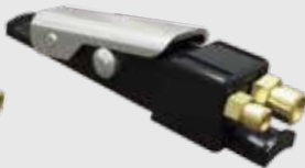
AirStop NPT Pneumatic Control Handle CAT-0302-02-00 Page 226 to 229