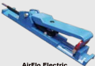
AirFlo Electric Control Handle CAT-0303-01-00 Page 246 to 249